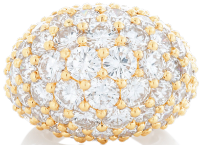
Cartier Diamond Cluster Suite