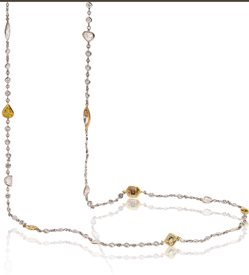
Multi-color "By The Yard" Diamond Necklace