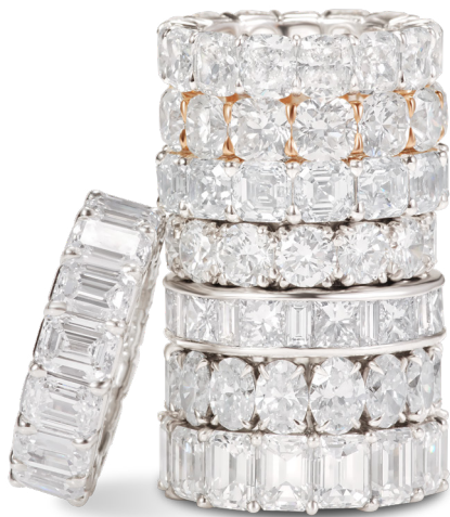
Stunning Eternity Bands