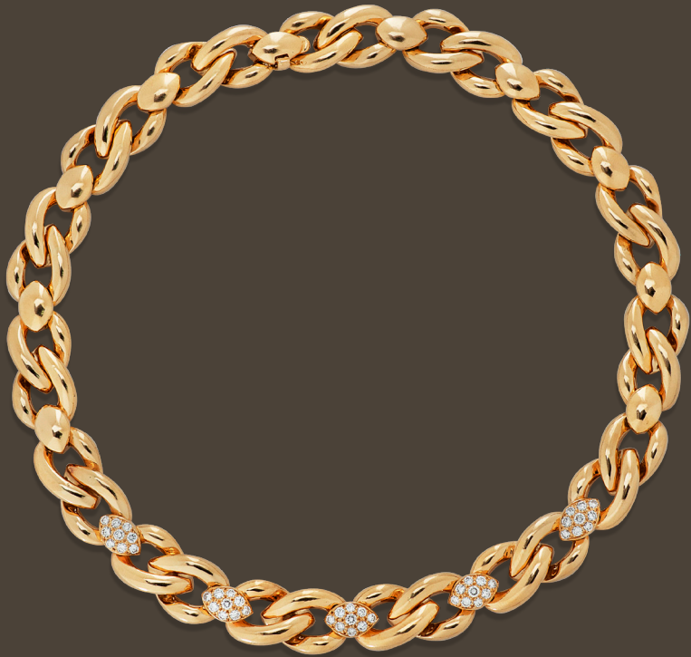
Yellow Gold Diamond Chain Necklace