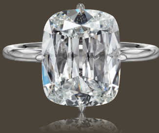
Diamond Engagement Rings