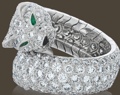
Diamond Cartier Panthère Ring