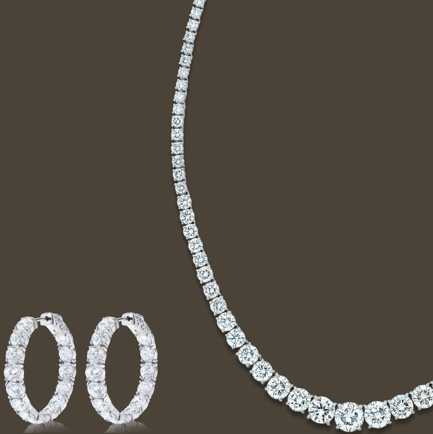
Round Diamond Hoops + Riviera Necklace