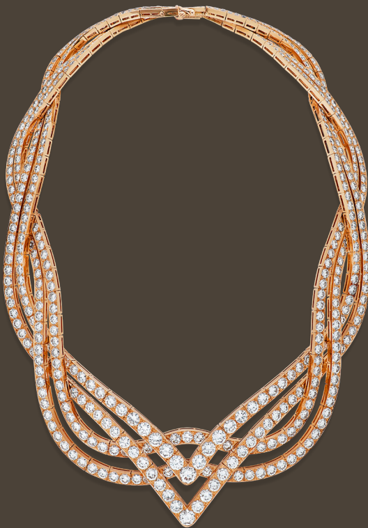
Vintage Van Cleef & Arpels Diamond Necklace