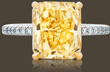
Yellow Diamond Rings