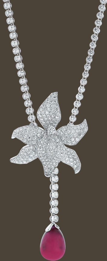
Diamond & Rubellite Necklace by Cartier