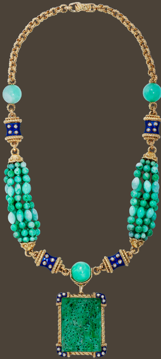
David Webb Jade & Lapis Necklace