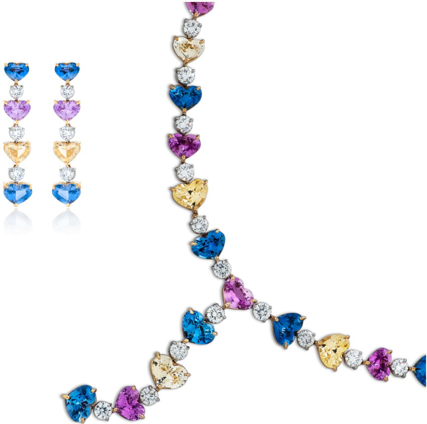
Multi-color Sapphire & Diamond Suite