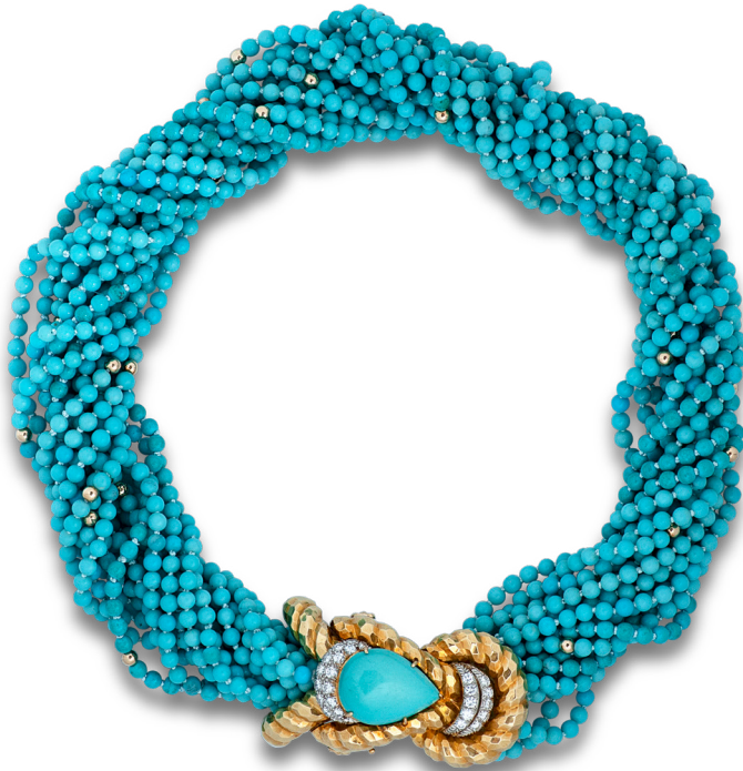
David Webb Turquoise Bead Necklace