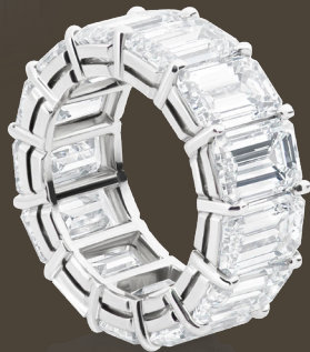
Emerald Cut Eternity Band - 1.5 carat each