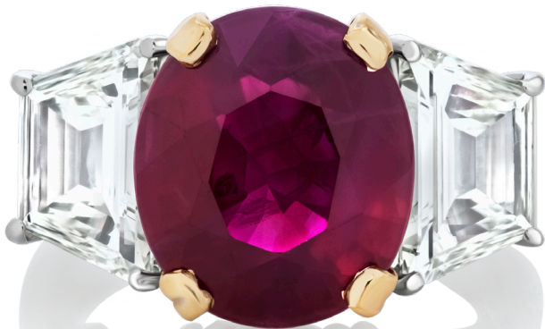
Burmese Ruby Ring