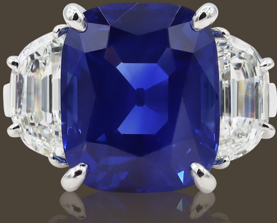
Kashmir Sapphire Ring