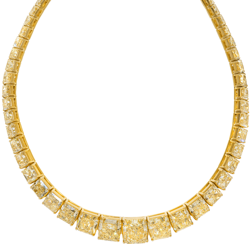
Fancy Yellow Necklace