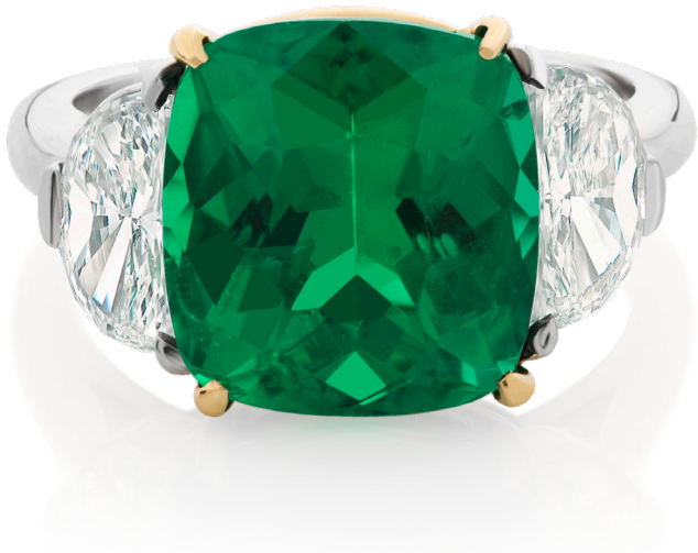
Tiffany & Co. Emerald Ring